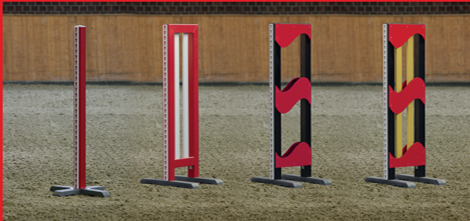
Options for the stands and wings:

Colors of these decorative items and the frames themselves can be chosen separately to create a colorful jump. The frames are also available in smaller version to act as a standing filler matching the looks of the jump. The jumping poles in these training jumps are a unique design with a polymer outside and a wooden insert. This assures a good weight, strength and also durability, safety and ease of maintenance.