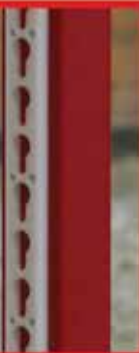
Polymer keyhole profile 75cm long