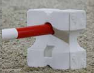
0102704: 50x50x20cm: € 47,50 / € 57,48