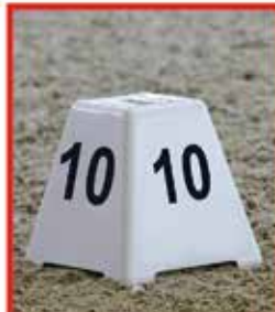
Number set (20 cones) € 612,85 / € 741,55