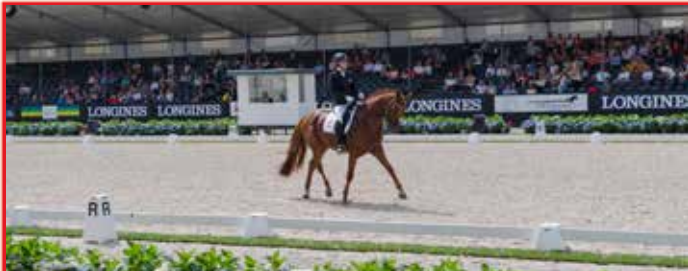
Dressage arena 20x60m including options for letters