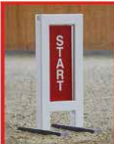
Start & Finish set 1x start - 1x finish € 245,- / € 296,45