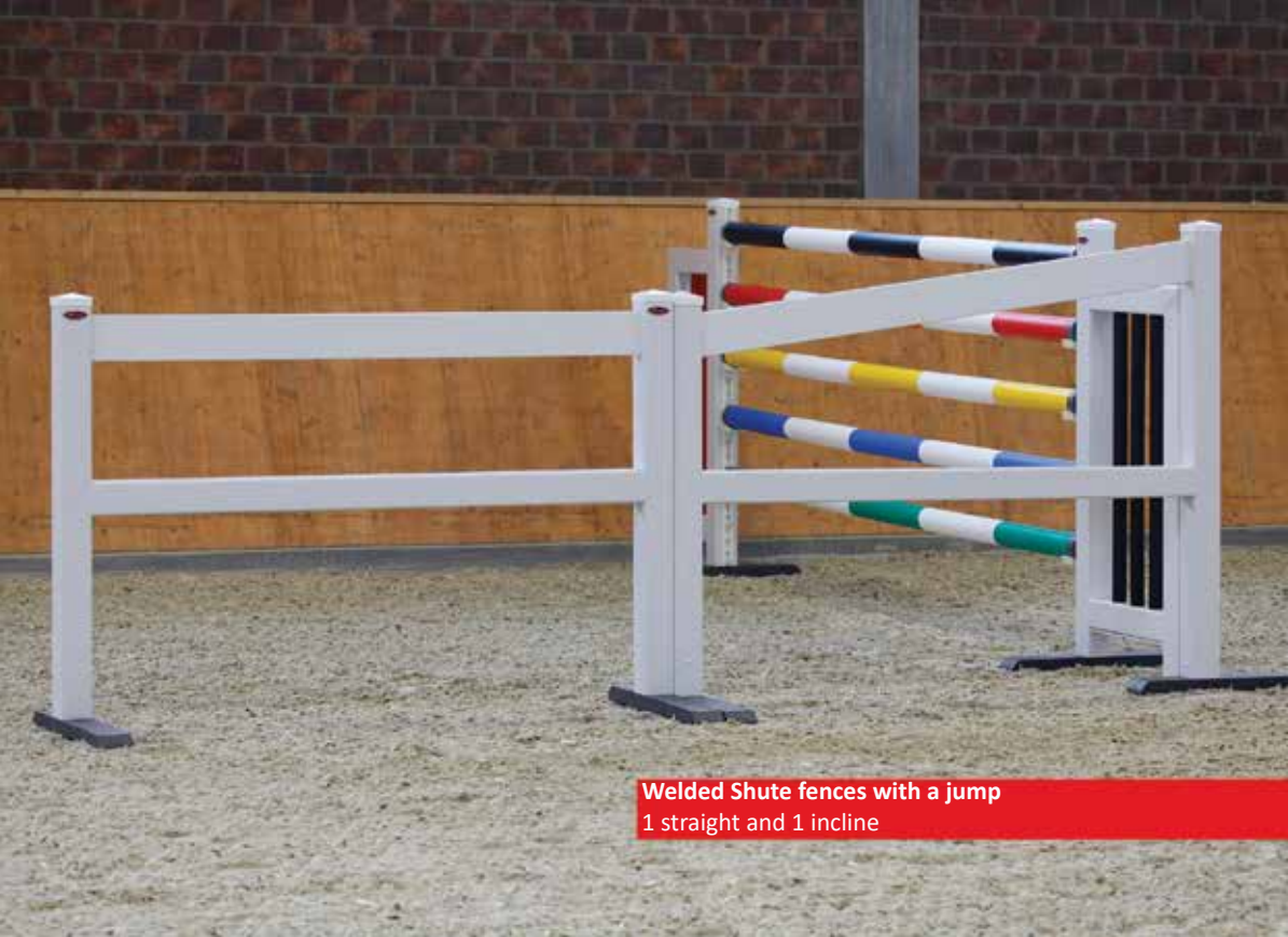
Welded Shute fences with a jump 1 straight and 1 incline