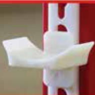
Polymer cup 20/25mm deep € 5,75 / € 6,96