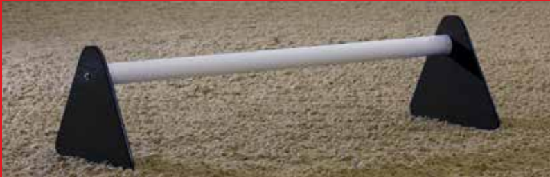
0102706: Cavaletti Birkhof, 1.8m triangular sides: € 97,50 / € 117,98