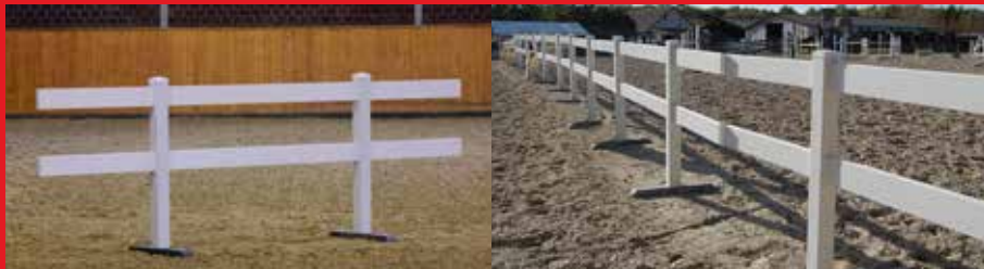
Portable divider fence segments 4 meter long: € 210,- / € 254,10