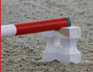
0102705: 30x30x14cm: € 25,- / € 30,25