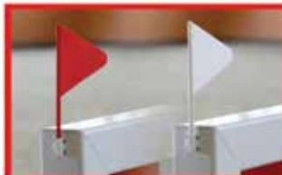
White or red flag with socket Per flag: € 3,27 / € 3,96