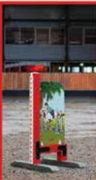
01020505 full-color 100x50cm:

Excl. VAT / Incl. VAT € 225,- / € 272,25