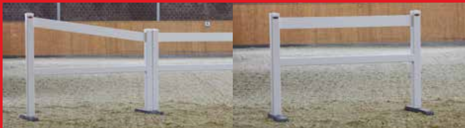
Welded Shute fence 2m: € 195,- / € 235,95 (straight) & € 210,- / € 254,10 (incline)