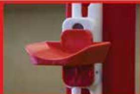
Safety cup 20mm deep € 24,96 / € 30,20