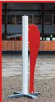
0102040 150cm high:

Excl. VAT / Incl. VAT € 125,- / € 151,25