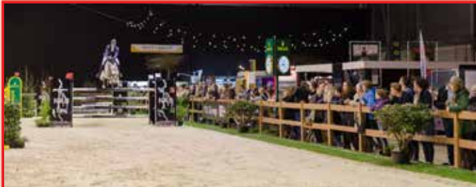
Heritage Rental fence and Artwood Rental fence. 80m per crate