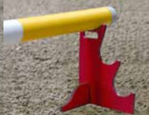
0102707: Set 2pc 40x30x30cm: € 55,- / € 66,55